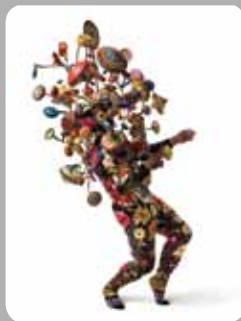
Nick Cave, Soundsuit, 2008, appliqué found knitted and crocheted fabric, metal armature, painted metal and wood toys.