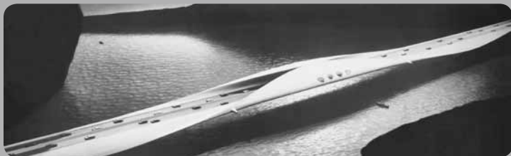
Paolo Soleri, example of Malfunction highway bridges model, 1960s

Soleri Bridges focuses on sixty years of Paolo Soleri’s bridge designs to coincide with the 2010 dedication of his first constructed bridge at the Scottsdale Waterfront commissioned by Scottsdale Public Art.