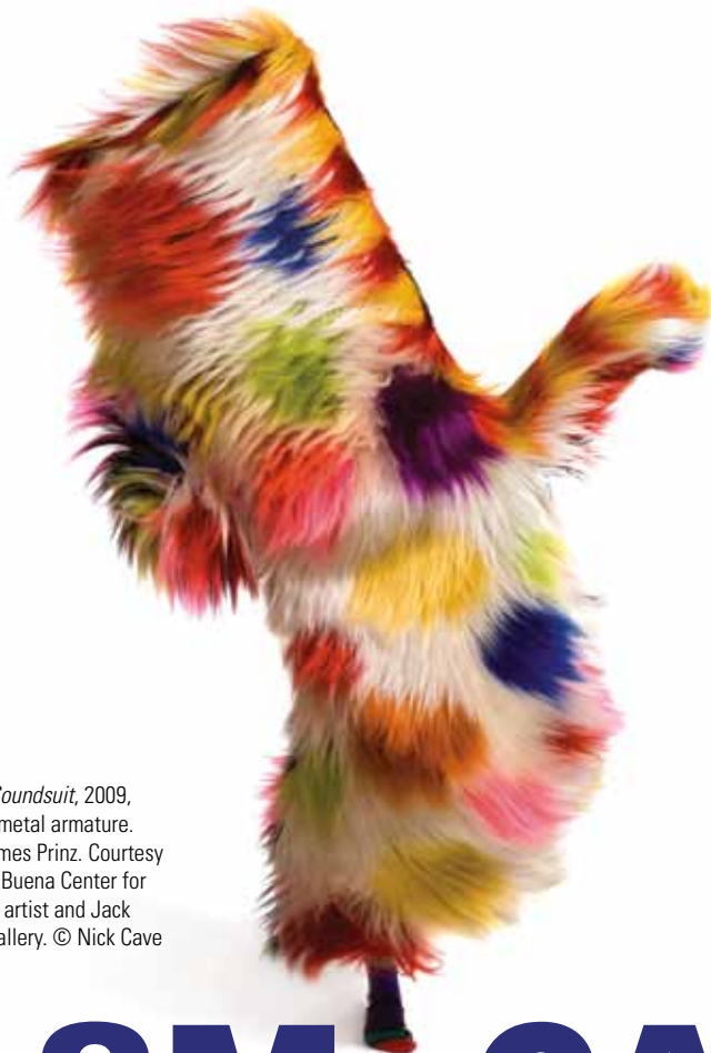
Nick Cave, Soundsuit, 2009, human hair, metal armature.