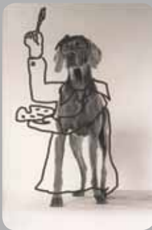
William Wegman, Role Models: The Artist, 1986, 12 1/2 x 9 1/2 inches, iris inkjet print on paper. Segura Publishing Company Archive, museum purchase.

Mention artist William Wegman's name and many people think of his quirky photographic images of Weimaraner dogs. Unexpected Wegman , however, highlights another side of this charming and insightful artist's practice. SMOCA is fortunate to have over forty-five works by Wegman in its collection. From light-hearted renderings of the artist's studio to quirky pictorial narratives, these works offer an unusual window into this important artist's playfully inquisitive thinking. Don't worry—along with the other kooky animals, those fun loving dogs always seem to make their way into the story.