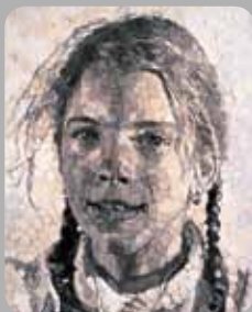
Chuck Close, Georgia , 1982, 48 x 38 inches, pulp-paper collage on canvas.

For more than 30 years, Chuck Close—renowned as one of America’s foremost artists in any media—has explored the art of printmaking in his continuing investigation into the principles of perception. This exhibition provides a comprehensive survey of the full extent of Close’s long involvement with the varied forms and processes of printmaking, and is the first comprehensive exploration of what can only be termed a prodigious accomplishment in the field. The exhibition features 118 works dating from 1972 to 2002. These prints constitute a remarkable self-portrait of the creative drive, vision and intellect of one of America’s most important living artists.